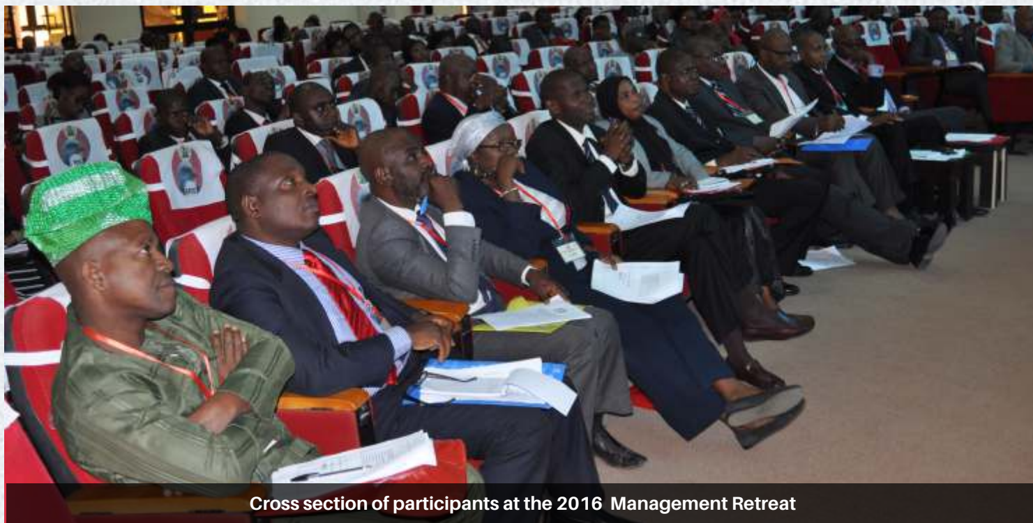
Cross section of participants at the 2016 Management Retreat

For the Economic and Financial Crimes Commission, EFCC, it has been 13 years of championing the anti-corruption crusade in Nigeria. And steadily, the anti-graft agency is altering the narrative of criminal prosecution in the country. But, not only has it remained a shining light, it is re-strategizing for the onerous task of sustaining efforts to rid the country of economic and financial crimes.