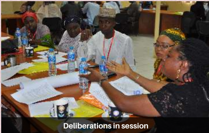
Deliberations in session