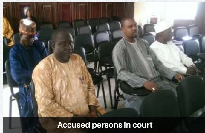
Accused persons in court