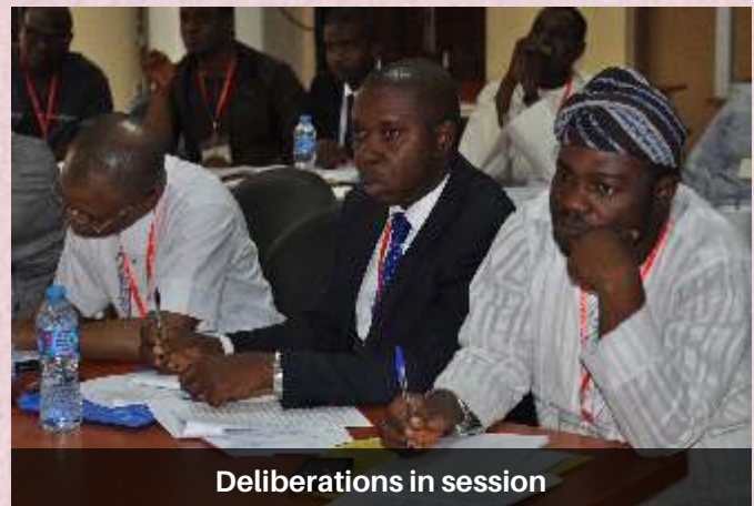
Deliberations in session