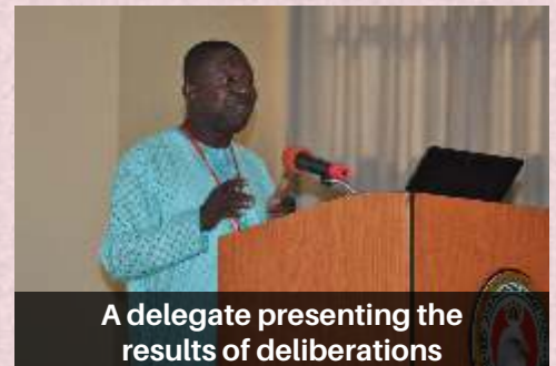
A delegate presenting the results of deliberations