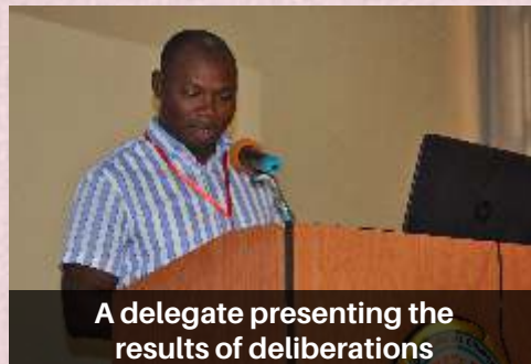
A delegate presenting the results of deliberations