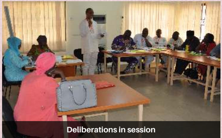
Deliberations in session