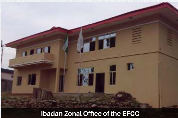
Ibadan Zonal Office of the EFCC

In a bid to expand the anti-corruption crusade to the grassroots, the EFCC has also opened a new zone in Ibadan, Oyo State, while re-opening the Maiduguri office, Borno State. ■