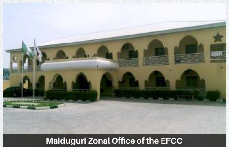
Maiduguri Zonal Office of the EFCC