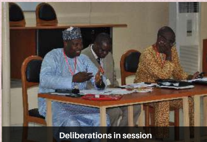
Deliberations in session