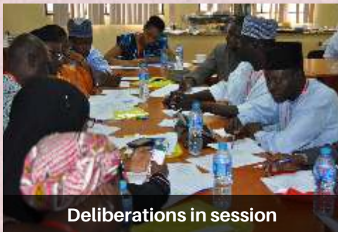
Deliberations in session