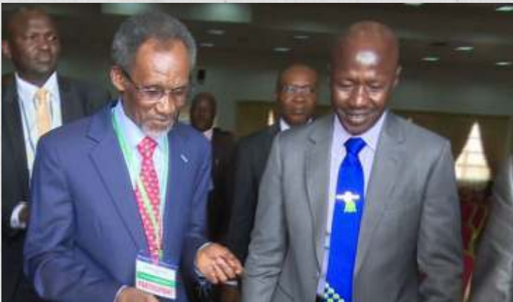
Chief Justice of Nigeria, Justice Mahmud Mohammed, and Magu at Judges Conference in November, 2015