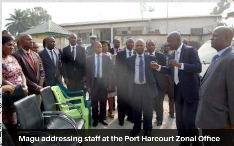
Magu addressing staff at the Port Harcourt Zonal Office

"The EFCC is an agency of international relevance and so you must not lose focus