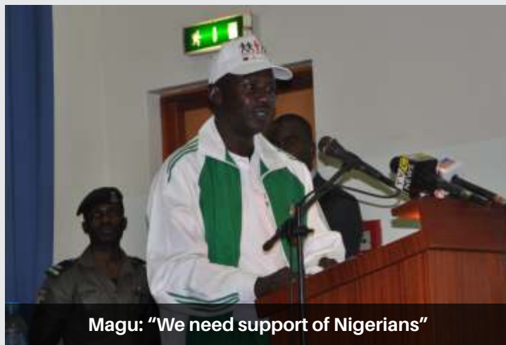
Magu: “We need support of Nigerians”

Magu told the gathering, which included dignitaries from the United Nations, Bureau of Public Service Reforms, BPSR, and Technical Unit on Governance and Anti-Corruption Reforms, TUGAR, that the EFCC was on top of the investigations into the scam, and “all the culprits in the arms procurement scandal would be brought to justice.”