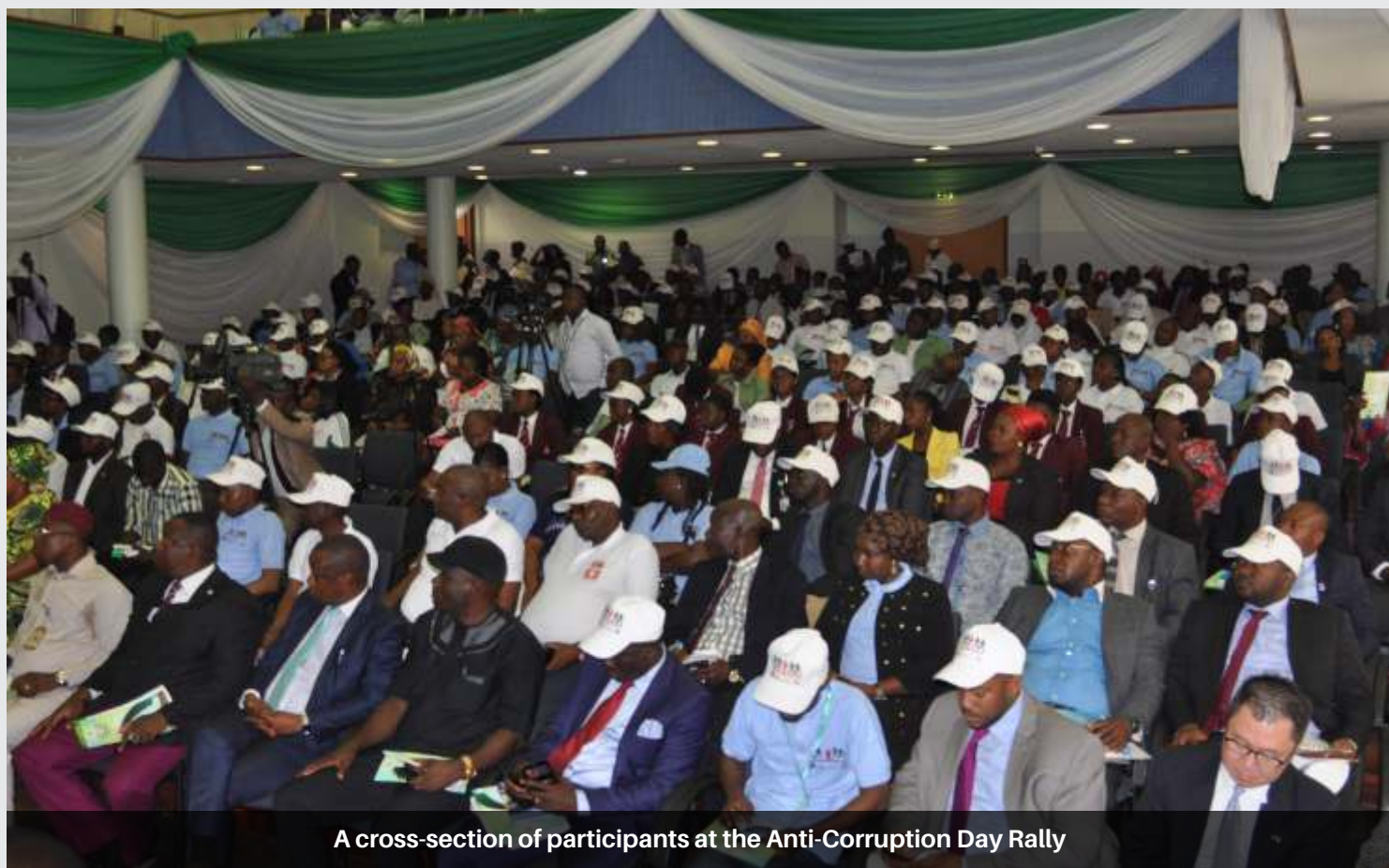
A cross-section of participants at the Anti-Corruption Day Rally