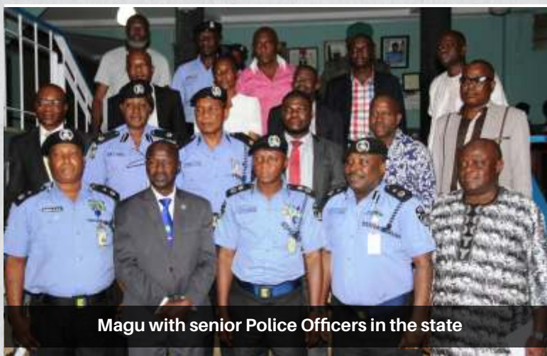
Magu with senior Police Officers in the state