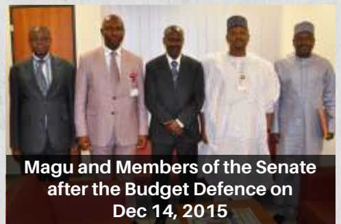
Magu and Members of the Senate after the Budget Defence on Dec 14, 2015