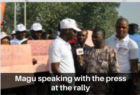
Magu speaking with the press at the rally