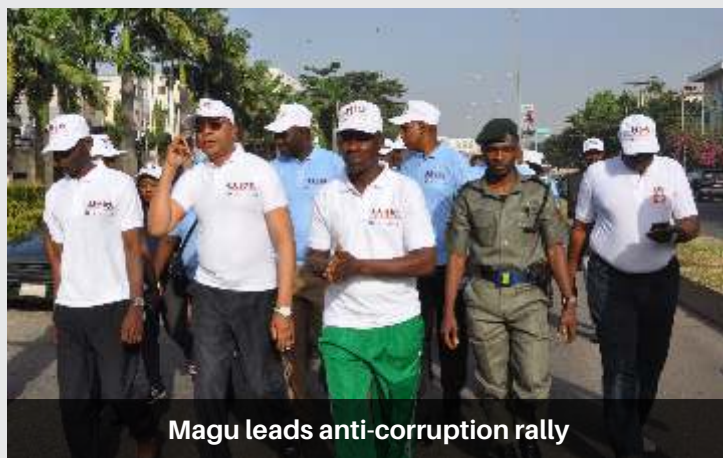
Magu leads anti-corruption rally