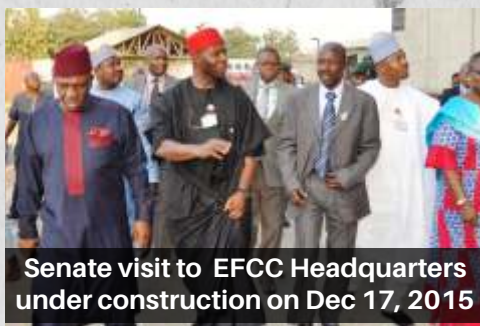
Senate visit to EFCC Headquarters under construction on Dec 17, 2015