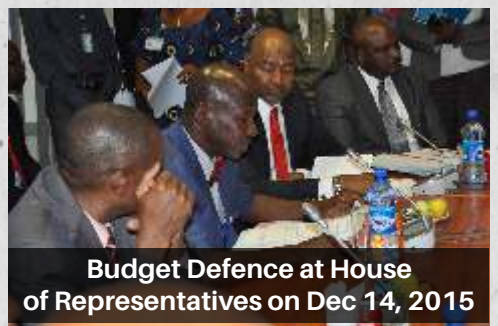
Budget Defence at House of Representatives on Dec 14, 2015