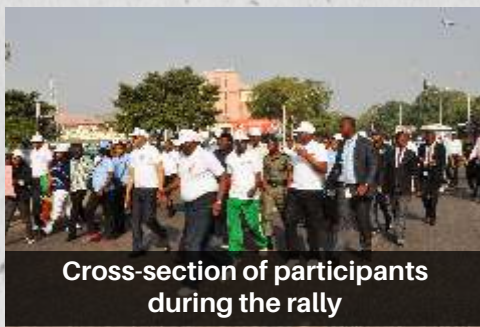
Cross-section of participants during the rally