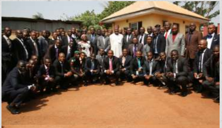
Magu and members of staff in Enugu during the courtesy visit to the South-East zone