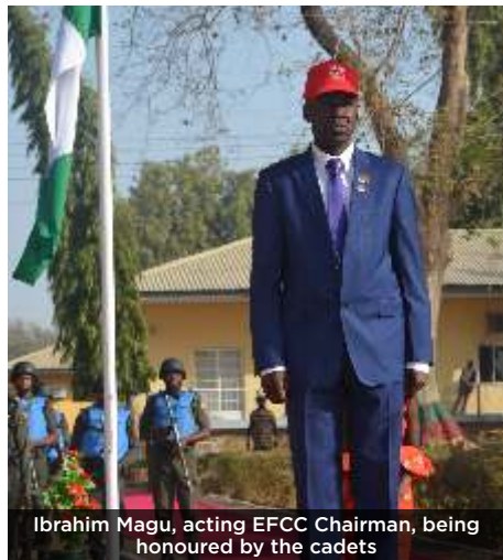
Ibrahim Magu, acting EFCC Chairman, being honoured by the cadets