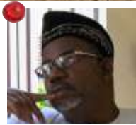
Bala Mohammed Offence: Bribery and false asset declaration Justice Abubakar Talba, FCT High Court, Gudu, Abuja In Court on: April 16, 2018