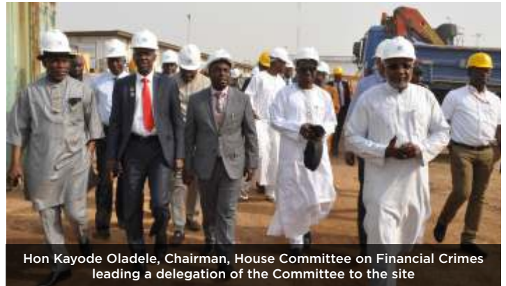
Hon Kayode Oladele, Chairman, House Committee on Financial Crimes leading a delegation of the Committee to the site