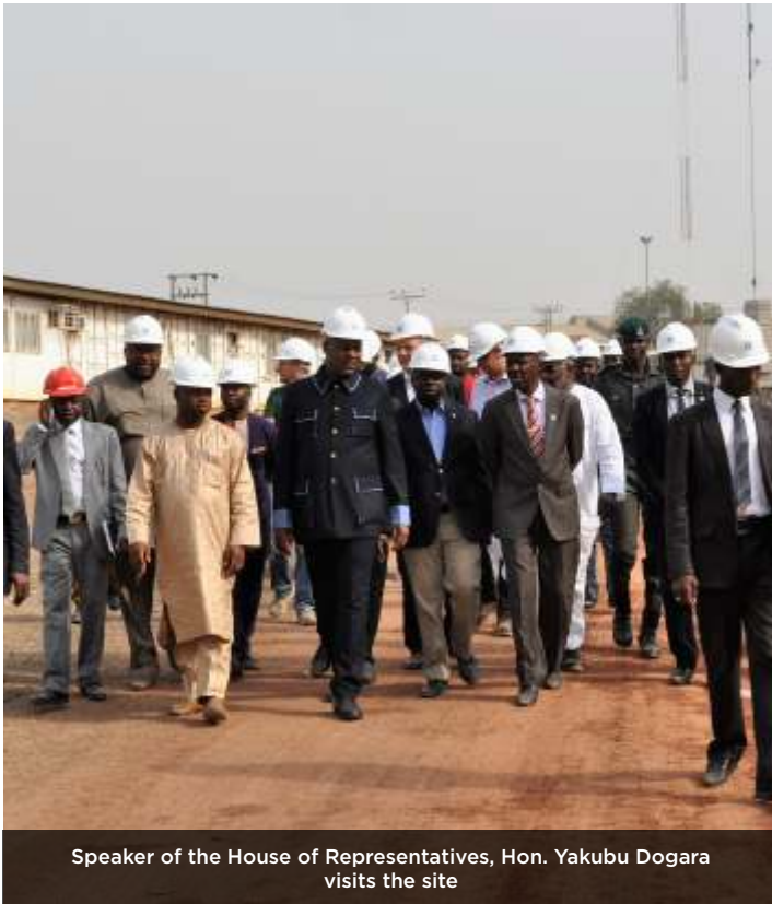
Speaker of the House of Representatives, Hon. Yakubu Dogara visits the site