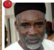
Murtala Nyako Offence: Abuse of office Justice Okon Abang Federal High Court, Abuja In Court on: February 26, 2018