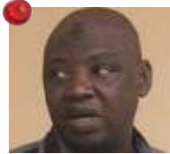
Justice Yinusa Mohammed Offence: Corrupt enrichment Justice Sherifat Solebo, Lagos State High Court, Ikeja In Court on: February 20, 2018