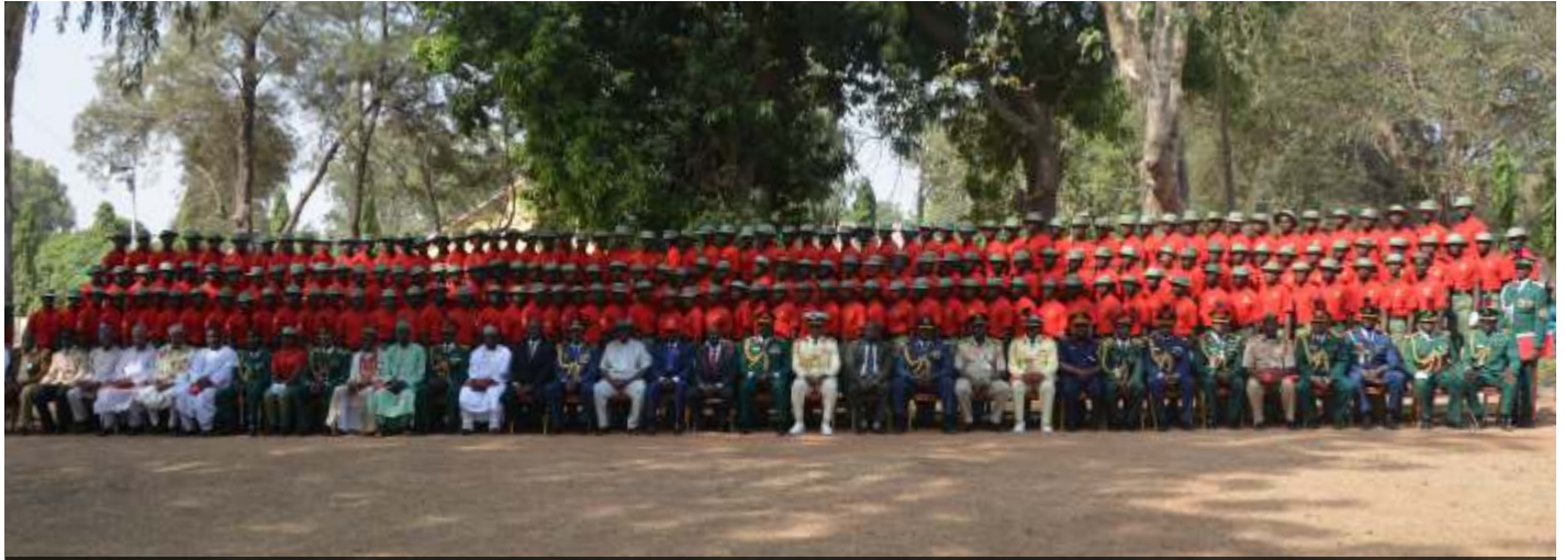
Cadets and Dignitaries at the event

Passing out parade of 183 cadets of the EFCC's Detective Inspector cadre, Course 4, at the Nigerian Defence Academy Parade Ground, Ribadu Campus, Kaduna, January 19. Below are images from the event: