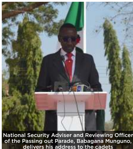
National Security Adviser and Reviewing Officer of the Passing out Parade, Babagana Munguno, delivers his address to the cadets