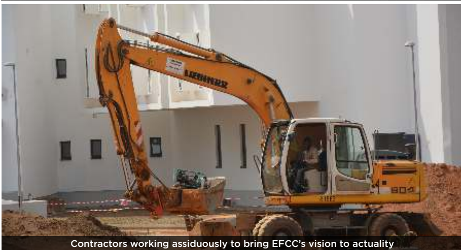
Contractors working assiduously to bring EFCC's vision to actuality