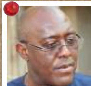
Olisa Metuh Offence: Destruction of evidence Justice Ishaq Bello, Federal High Court, Maitama In Court on: March 7, 2018