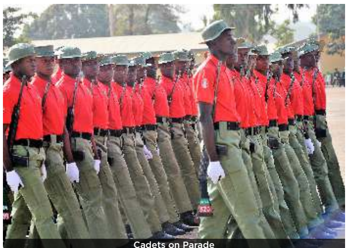
Cadets on Parade