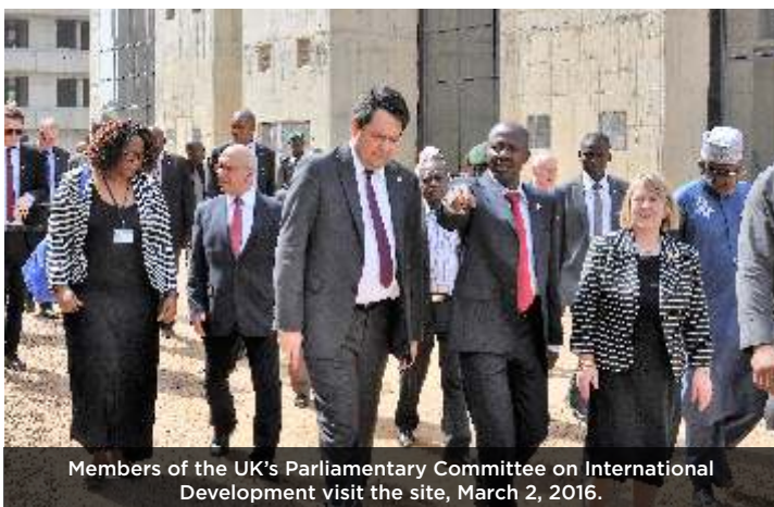
Members of the UK's Parliamentary Committee on International Development visit the site, March 2, 2016.

“President Muhammadu Buhari is determined to strengthen the anti-graft agency in the fight against corruption,” he said. Stressing the importance of