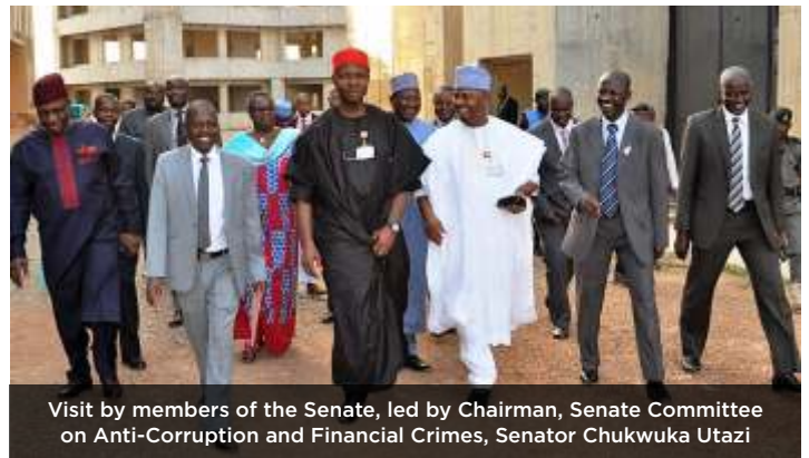
Visit by members of the Senate, led by Chairman, Senate Committee on Anti-Corruption and Financial Crimes, Senator Chukwuka Utazi

ensuring adequate electricity supply for the facilities, Fashola noted that “because of the sophistication in terms of the equipment, there will be need for alternative source of power”, adding that, “more importantly, the visit is also to see how we can plan to power the infrastructure and connect them to the grid”.