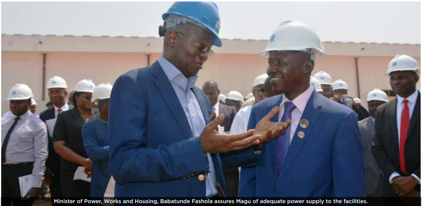
Minister of Power, Works and Housing, Babatunde Fashola assures Magu of adequate power supply to the facilities.