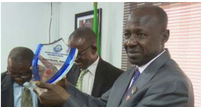
Magu receives "Operations Management Man of the Year" award, bestowed on him by Chartered Institute of Operations of Nigeria, for courage and integrity in the fight against corruption, February 8