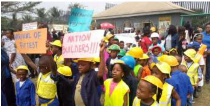
Pupils of St. Mary Dedication Education Centre, Benin City, Edo State during a sensitization programme held by the EFCC at the school's career day celebration.