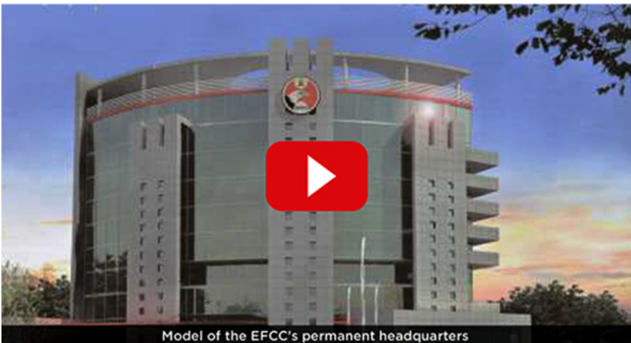
Model of the EFCC's permanent headquarters

What was meant to have been completed in three years has now, fortuitously, become a reality.