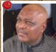
Jolly Nyame Offence: Criminal breach of trust Justice Adebukola Banjoko, FCT High Court, Gudu, Abuja In Court on: February 28, 2018