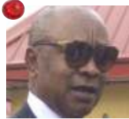
Innocent Umezulike Offence: Bribery, perversion of justice Justice A. A. Onovo, Federal High Court, Enugu In Court on: February 21, 2018