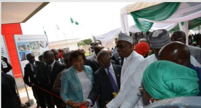
Buhari cuts the tape at the commissioning.