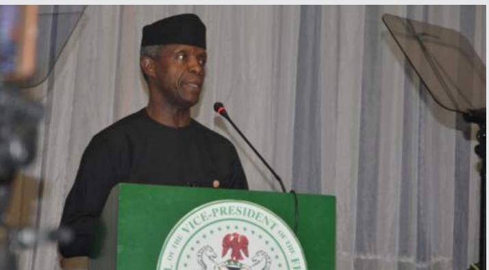
Osinbajo: "We must work hard to build cooperation and mutual understanding".