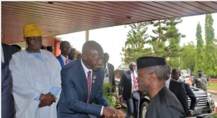
Vice President Osinbajo being welcomed to the event by Magu.