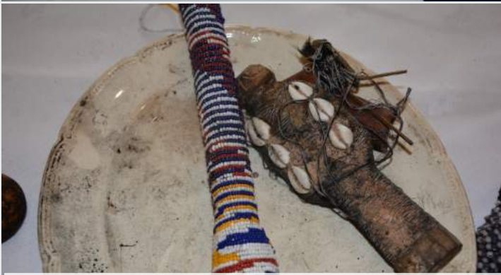
Fake charms exhibited at the event.