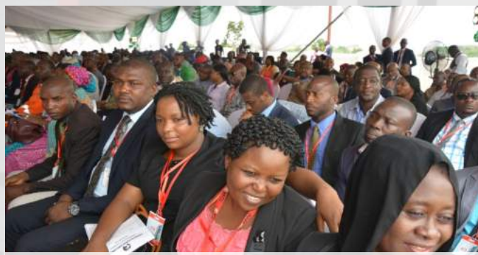
Cross-section of EFCC staff at the event.