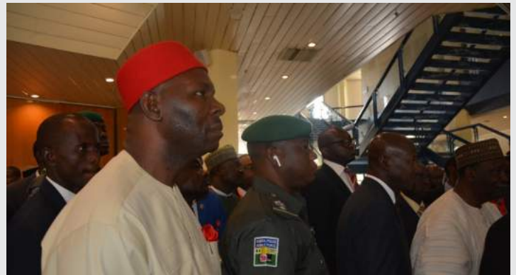
Senator Chukwuka Utazi, along with participants at the event.