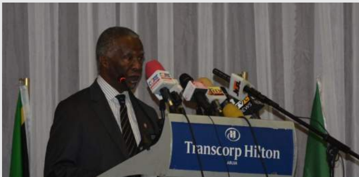
Mbeki: "Africa must partner to ensure recovery of stolen assets".