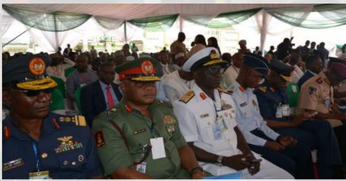
Cross-section of military officers at the event.