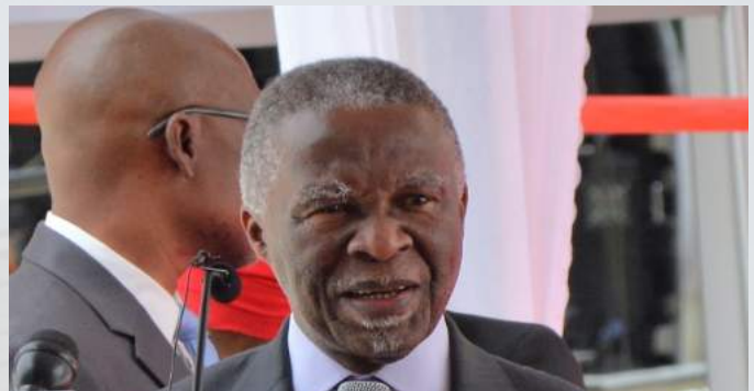
Mbeki: "It's important EFCC staff are looked after by empowering them, so they don't fall into temptations".