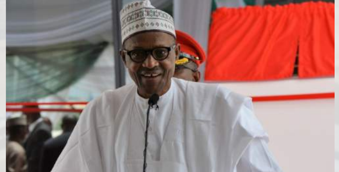
Buhari: "We're determined to hold public officers accountable, no matter how long it takes".