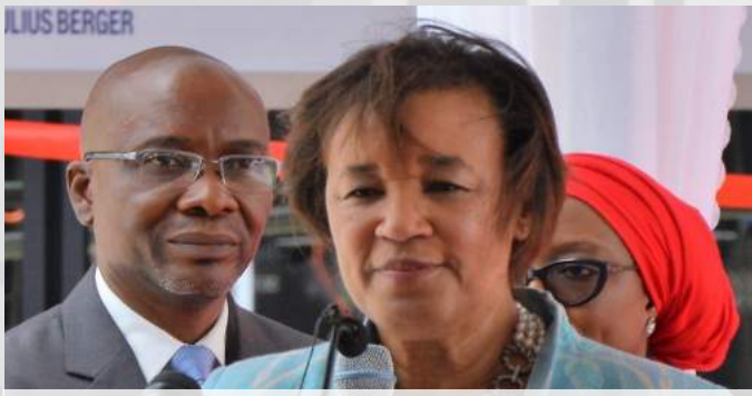
Scotland: "The edifice is unique in Africa".