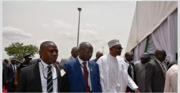
Buhari being ushered in to the venue.