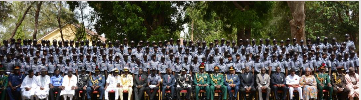
Group photo of Cadets and dignitaries at the event