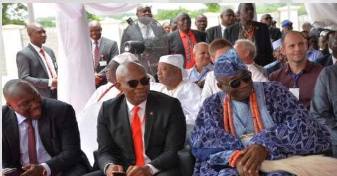
The Oba of Lagos, Rilwanu Akiolu, with Tony Elumelu, Chairman, Heirs Holdings