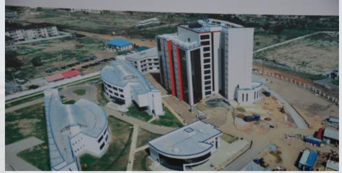
Aerial view of the new EFCC's Head Office Complex.