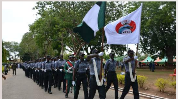
Cadets taking part in the march- past