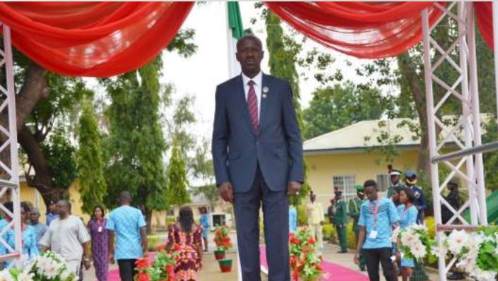
Ibrahim Magu, acting EFCC Chairman at the parade ground

On May 11, 2018 the EFCC graduated 314 cadets of the Detective Superintendent Course 7, at the Nigerian Defence Academy Parade Ground, Ribadu Campus, Kaduna. The colourful passing-out-parade was the climax of 13 months of rigorous training to avail the officers with the necessary skills of law enforcement.