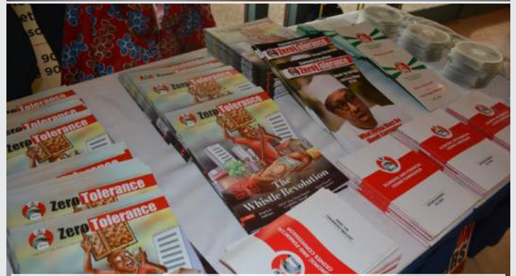
Some publications of the EFCC showcased at the event.