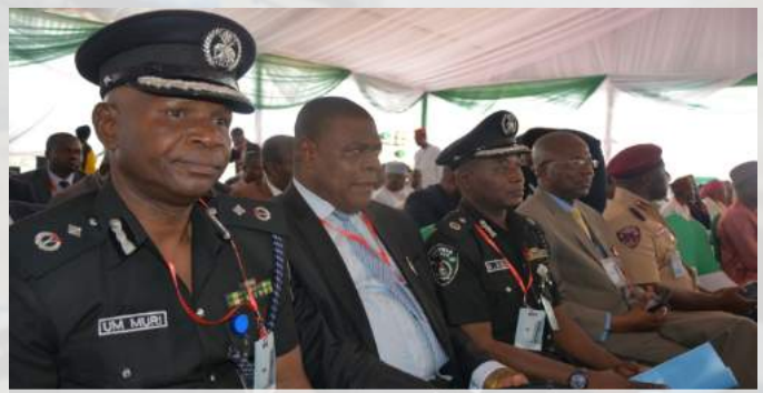
Cross-section of Police officers at the event.