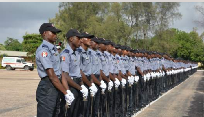
Captivating array of the cadets on parade