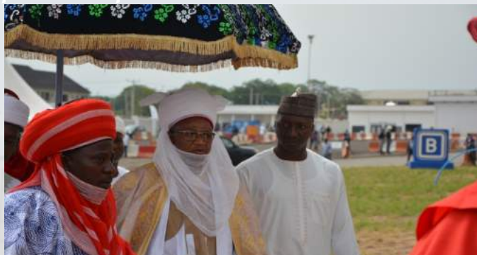
Traditional leaders at the event.