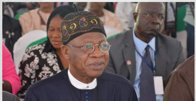
Lai Mohammed, Minister of Information and Culture.