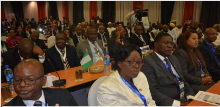
Cross-section of African delegates at the event.