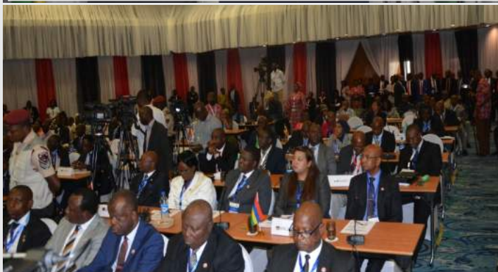
Cross-section of dignitaries at the event.