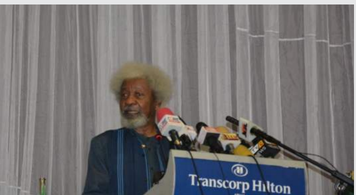
Soyinka: "Our leaders must pass through the jail doors of the new EFCC headquarters".