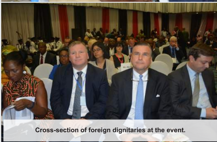
Cross-section of foreign dignitaries at the event.