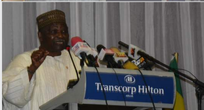
Gowon: "Our leaders must be honest with themselves".