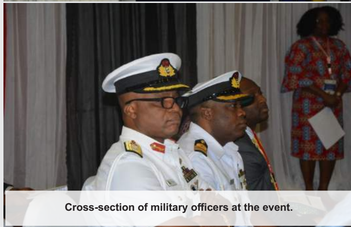
Cross-section of military officers at the event.