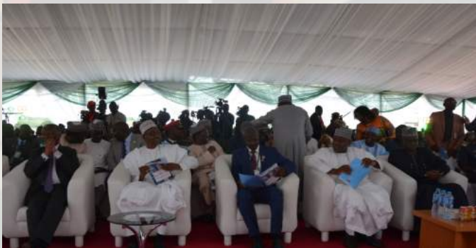
L-R: Mbeki, Buhari, Magu, Dogara and Boss Mustapha, Secretary to the Government.