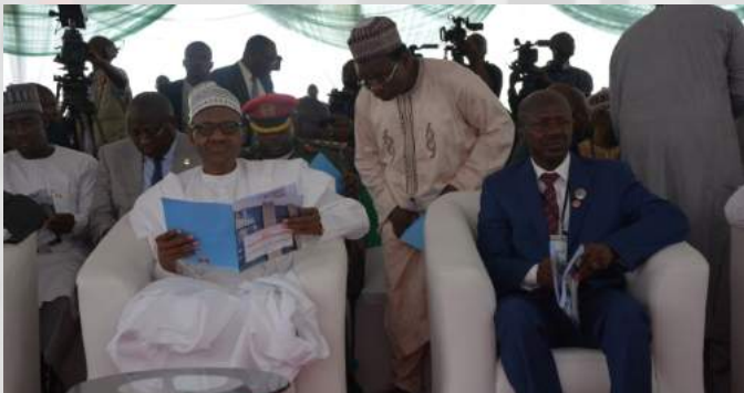
Buhari seated with Magu