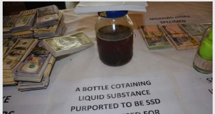
Fake materials as part of exhibits displayed at the event.