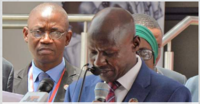
Magu: "EFCC is ready to carry on with the fight in accordance with rule of law".