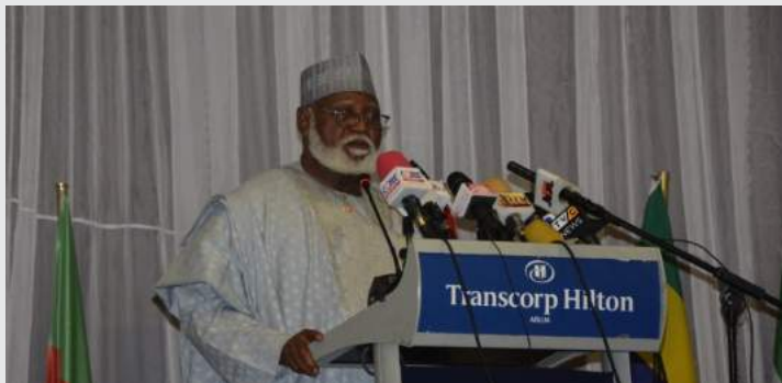
Abdulsalami: "EFCC deserves commendation".