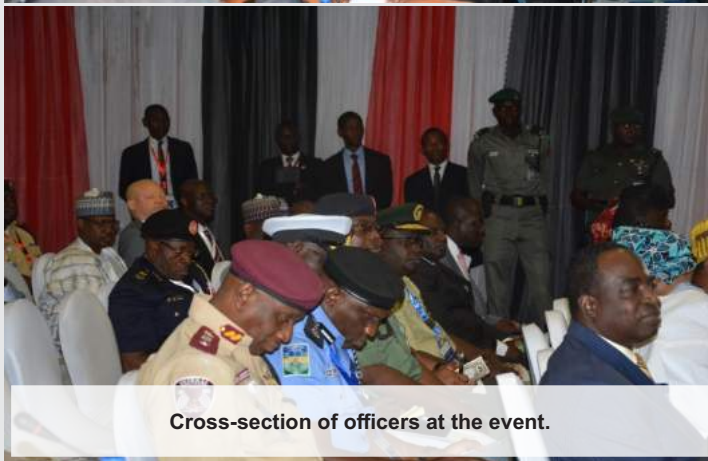
Cross-section of officers at the event.