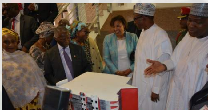
Buhari and other dignitaries being led on a tour of the building.