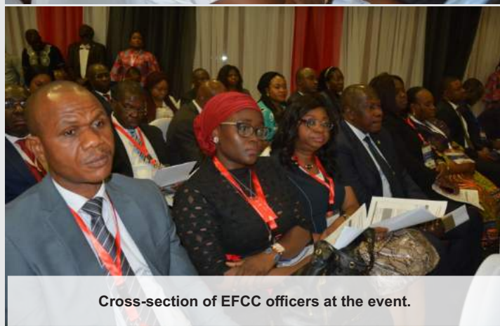
Cross-section of EFCC officers at the event.