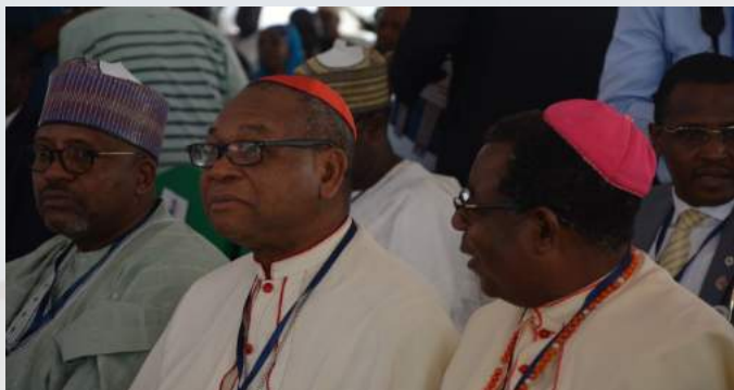
Christian religious leaders at the event.