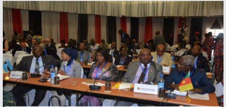
Cross-section of delegates from Cameroon.