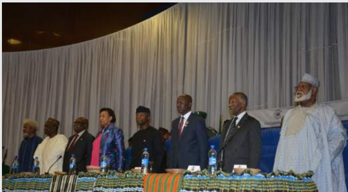
L-R: Soyinka, Gowon, Onnoghen, Scotland, Osinbajo, Magu, Mbeki and Abdulsalami.