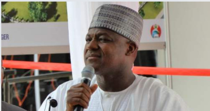
Dogara: "It is time for us to look at the welfare package of the staff".