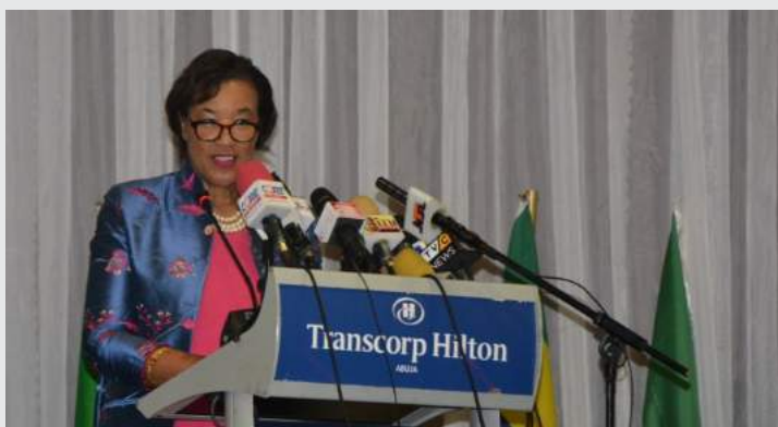
Scotland: "Nigeria will get its [stolen] money back".