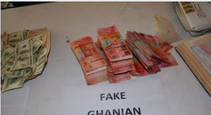
Exhibition of fake currencies displayed at the event.