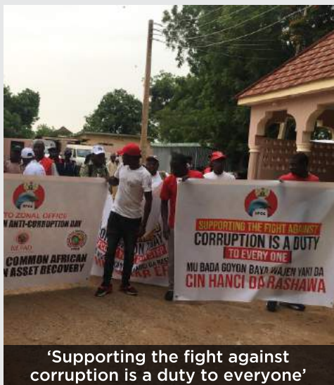
'Supporting the fight against corruption is a duty to everyone'