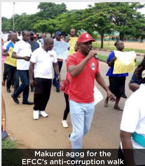
Makurdi agog for the EFCC's anti-corruption walk