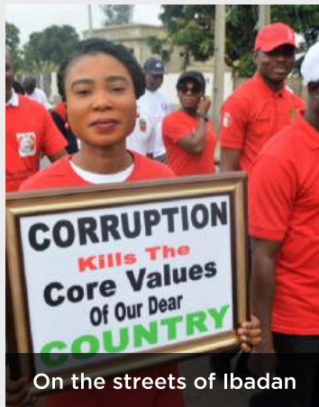
On the streets of Ibadan