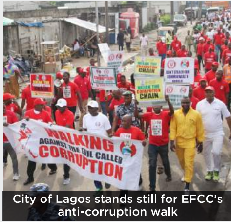
City of Lagos stands still for EFCC's anti-corruption walk