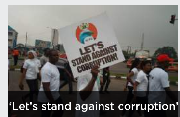
‘Let’s stand against corruption’