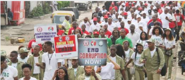
National Youth Service Corps members join in the walk

“All monies stolen from Nigeria and stashed out of the country will be repatriated,” he said.