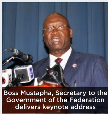
Boss Mustapha, Secretary to the Government of the Federation delivers keynote address

On his part, acting EFCC Chairman, Ibrahim Magu, noted that since the adoption of the African Union Convention on Preventing and Combating Corruption on July 11, 2003 in Maputo, Mozambique, tremendous progress has been made across the continent in the area of sensitizing the citizenry against corruption.