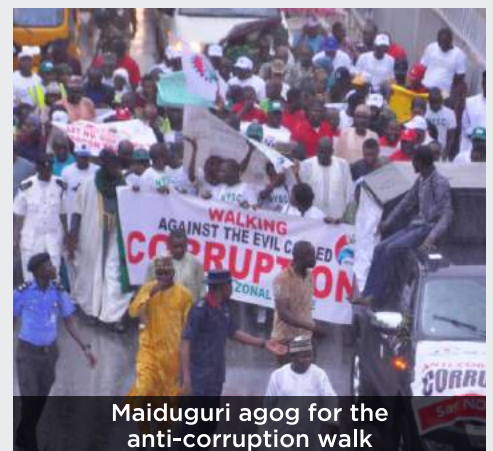
Maiduguri agog for the anti-corruption walk