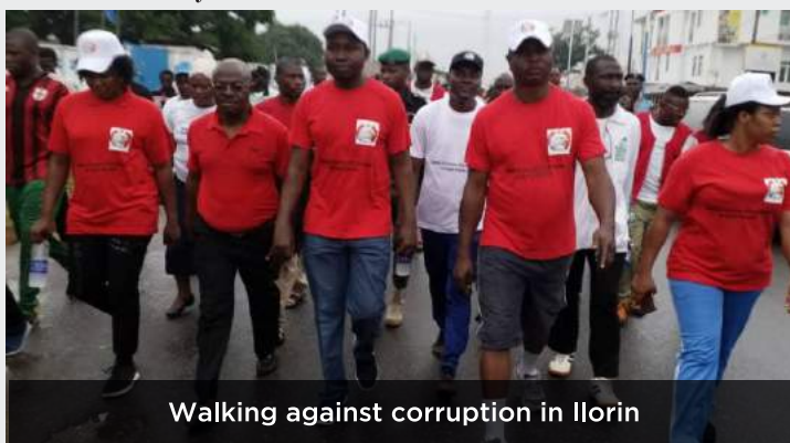
Walking against corruption in Ilorin

The walk was organized in partnership with major stakeholders including the Federal Road Safety Corps, National Orientation Agency, Nigeria Security and Civil Defence Corps, and members of the media, as they joined forces with the EFCC to drive home this year’s message of assets recovery and return.