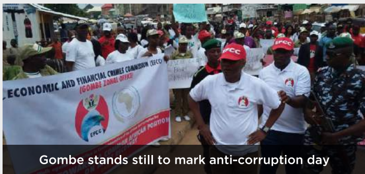
Gombe stands still to mark anti-corruption day

“Unless and until Nigerians determine to expose and hold public officials accountable for their stewardship and not view the fight against corruption from ethnic, political and religious perspectives, the war might never be won even if battles are won,” said Usman Imam, Zonal Head.