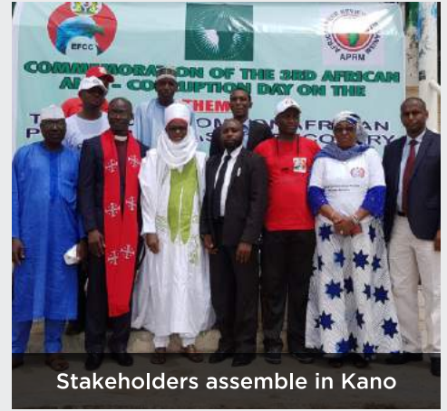
Stakeholders assemble in Kano