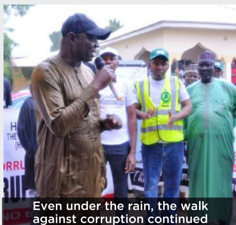
Even under the rain, the walk against corruption continued