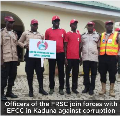
Officers of the FRSC join forces with EFCC in Kaduna against corruption