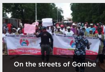
On the streets of Gombe