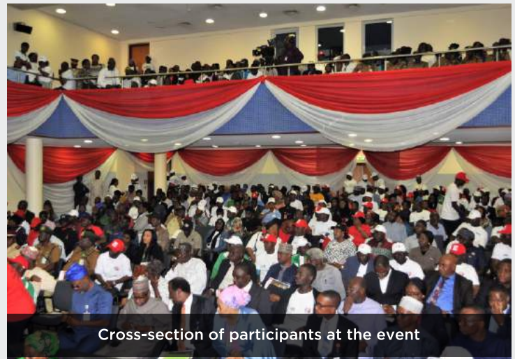
Cross-section of participants at the event

As part of this year’s event, the EFCC also held a road walk from the Commission’s Zonal Office at Wuse 2 to the Yar’Adua Centre, which was climaxed with the burning of a mock corruption coffin at the Eagles Square, to mark the symbolic end of corruption in Nigeria. Similar walk against corruption was also held across the zonal offices of the EFCC in the country, including Benin, Enugu, Ibadan, Lagos, Port Harcourt, Kaduna, Kano, Gombe, Maiduguri, Makurdi, Ilorin, Sokoto and Uyo.