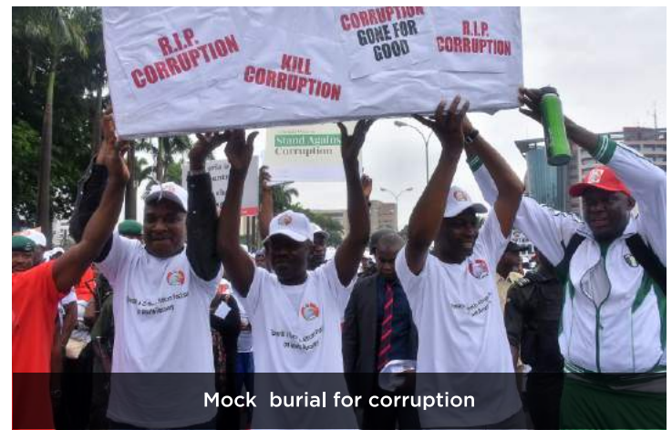
Mock burial for corruption

Special Guest of Honour, at the event, Boss Mustapha, Secretary to the Government of the Federation, SGF, commended the EFCC for “its unrelenting efforts to trace and recover stolen assets, and where they are located abroad, to repatriate them to their rightful owners.” “The government is committed to this cause,” he said.