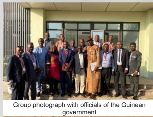
Group photograph with officials of the Guinean government