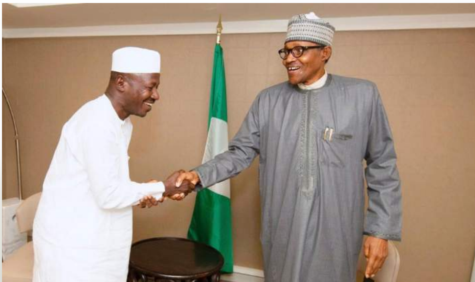
Confidence: President Muhammadu Buhari shakes Magu at the 74th United Nations General Assembly, New York, United States, September 27, 2019