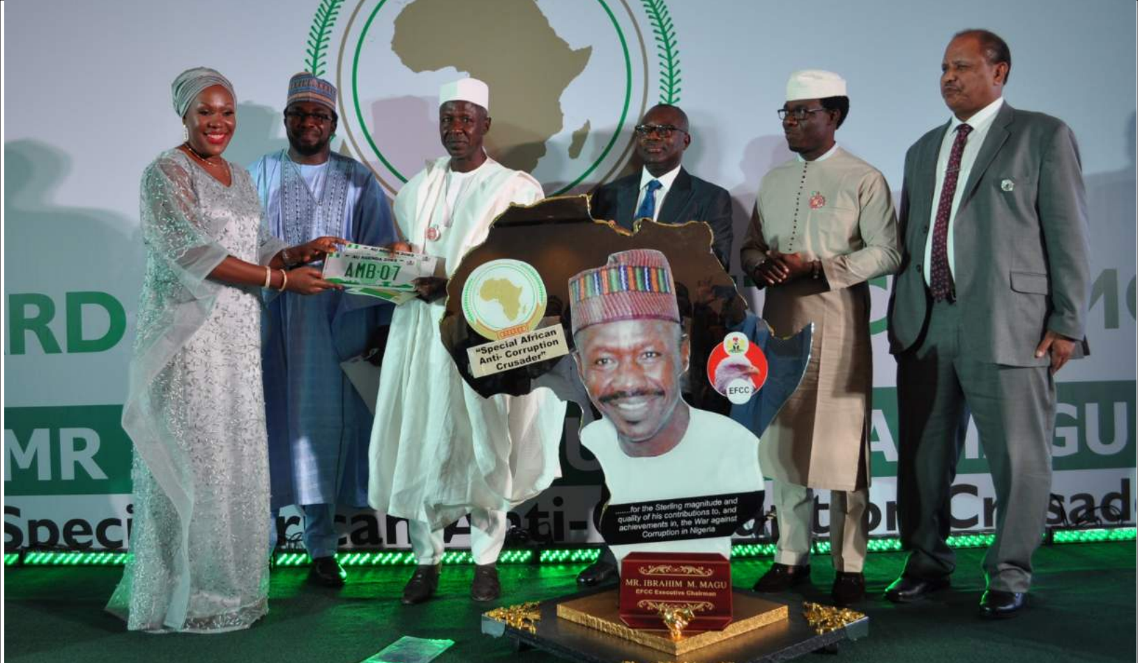
Iconic Award for the “Special Anti-Corruption Crusader”

you do the crime, you must do the time. Nobody is above the law; you can report anybody found to be involved in corrupt practices [and we will act on it]. The fight has just started and we will do it to the last. We will get them [corrupt individuals] out, just give me 12 months, you will not see them again.